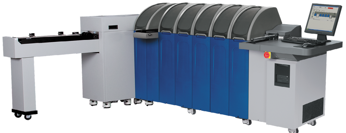
MXD210 Card Delivery System

Print-on-demand: Leverage black and white printing inline, feeding pre-printed sheets into the system.