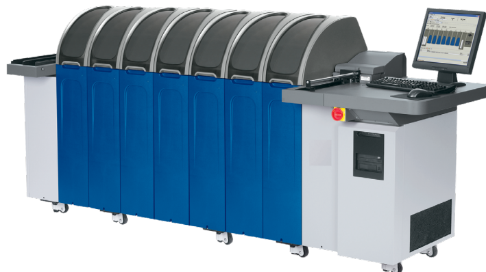
MX2100 Card Issuance System

Service and support: The MX Series platform is supported by the industry's largest service and support network, which spans more than 150 countries worldwide. Online and phone support is available 24/7.