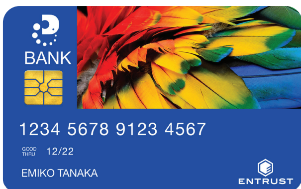
Varnish-Enhanced, Full-Color Printing

The DoD Printing Module employs innovative UV-curable technology to print high-resolution card designs that draw attention. Print full-color, edge-to-edge designs from blank white cards.