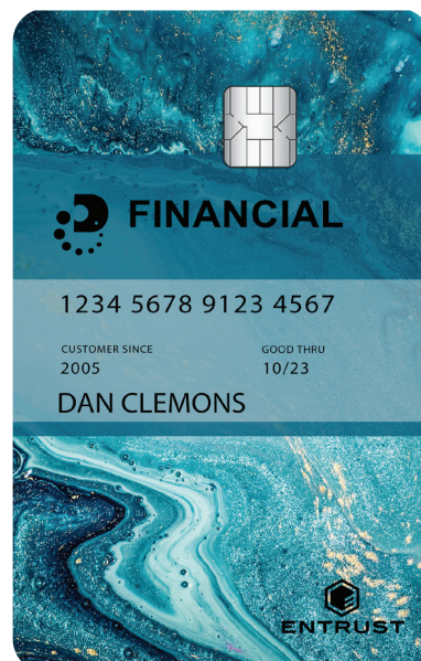
Vertical Card Printing