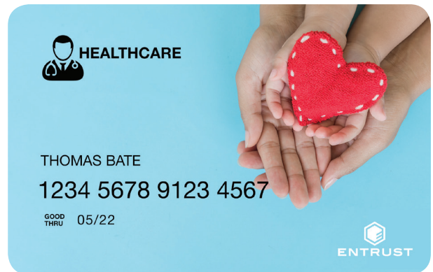
Precise Personalization, Varnish Durability