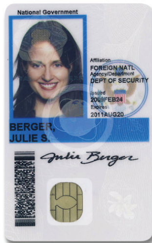
FEDERAL GOVERNMENT EMPLOYEE ID