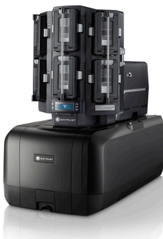
Multi-hopper with embosser

Learn more about the DS4 ES1-K printer at entrust.com